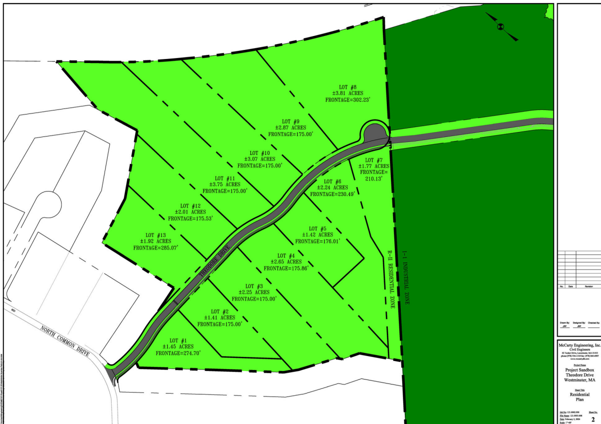
Residential Plan 2