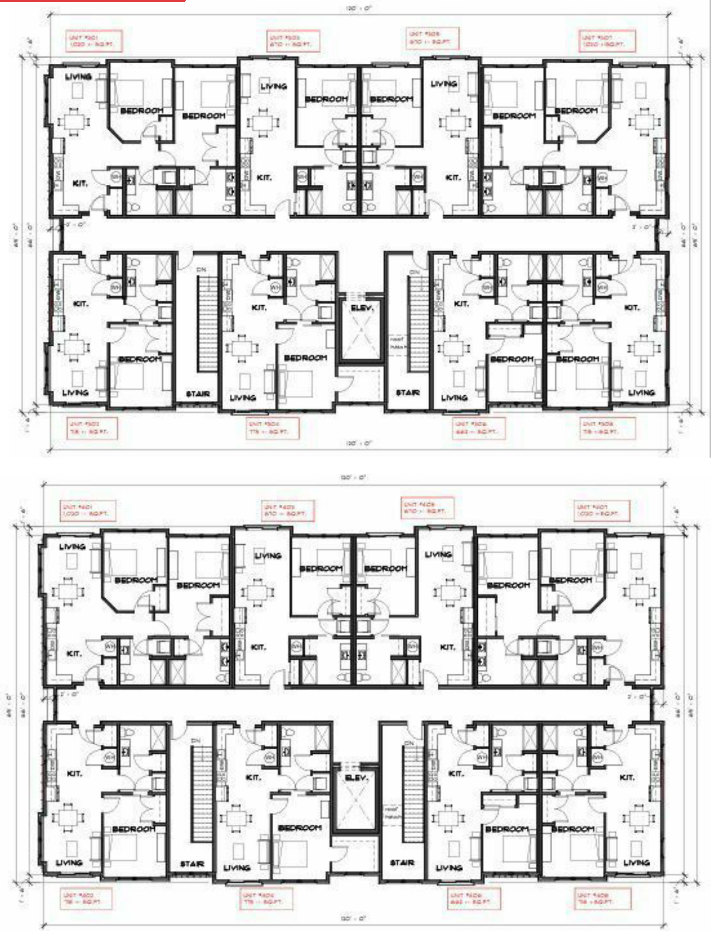
1 F. 4TH FLOOR 1/8" = 1'-0"