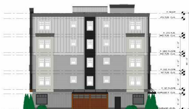
2 LEFT ELEVATION 1/8" = 1'-0"