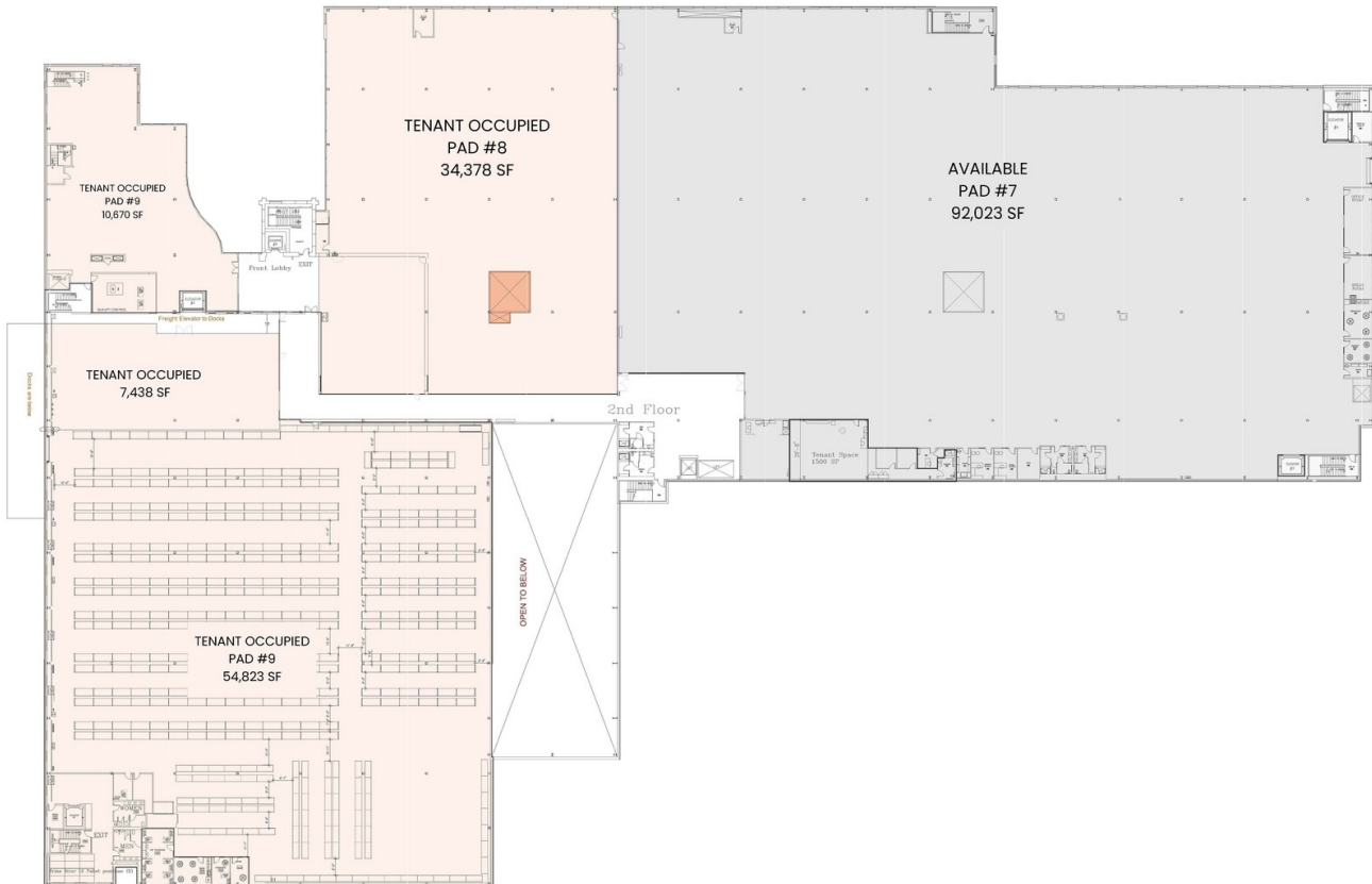
Scale 1/64" = 1'-0" IndusPAD: 2nd Floor Layout with Tenant Locations