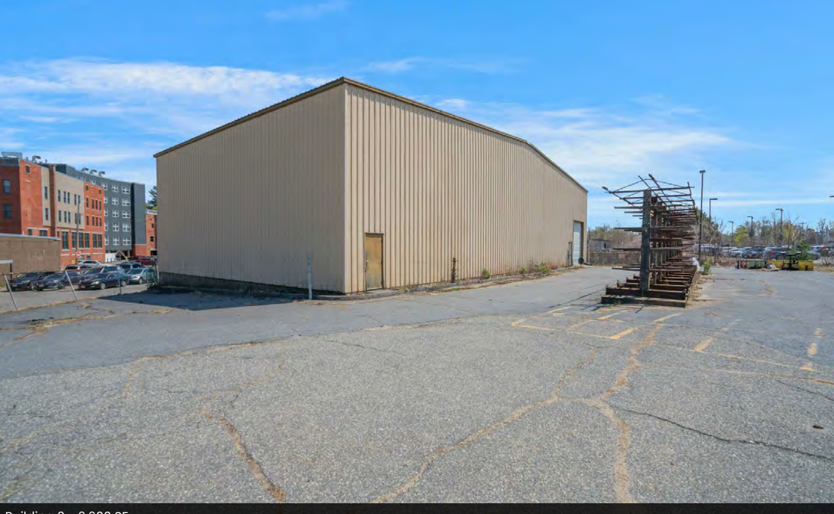
Building 2 - 6,600 SF