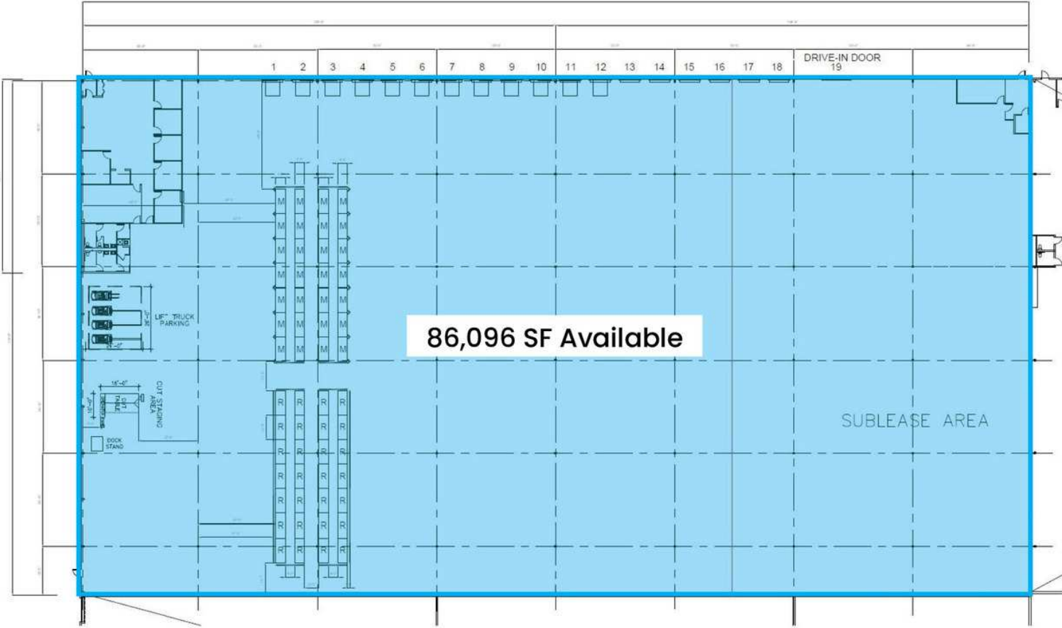
19 Tailboard Loading Docks