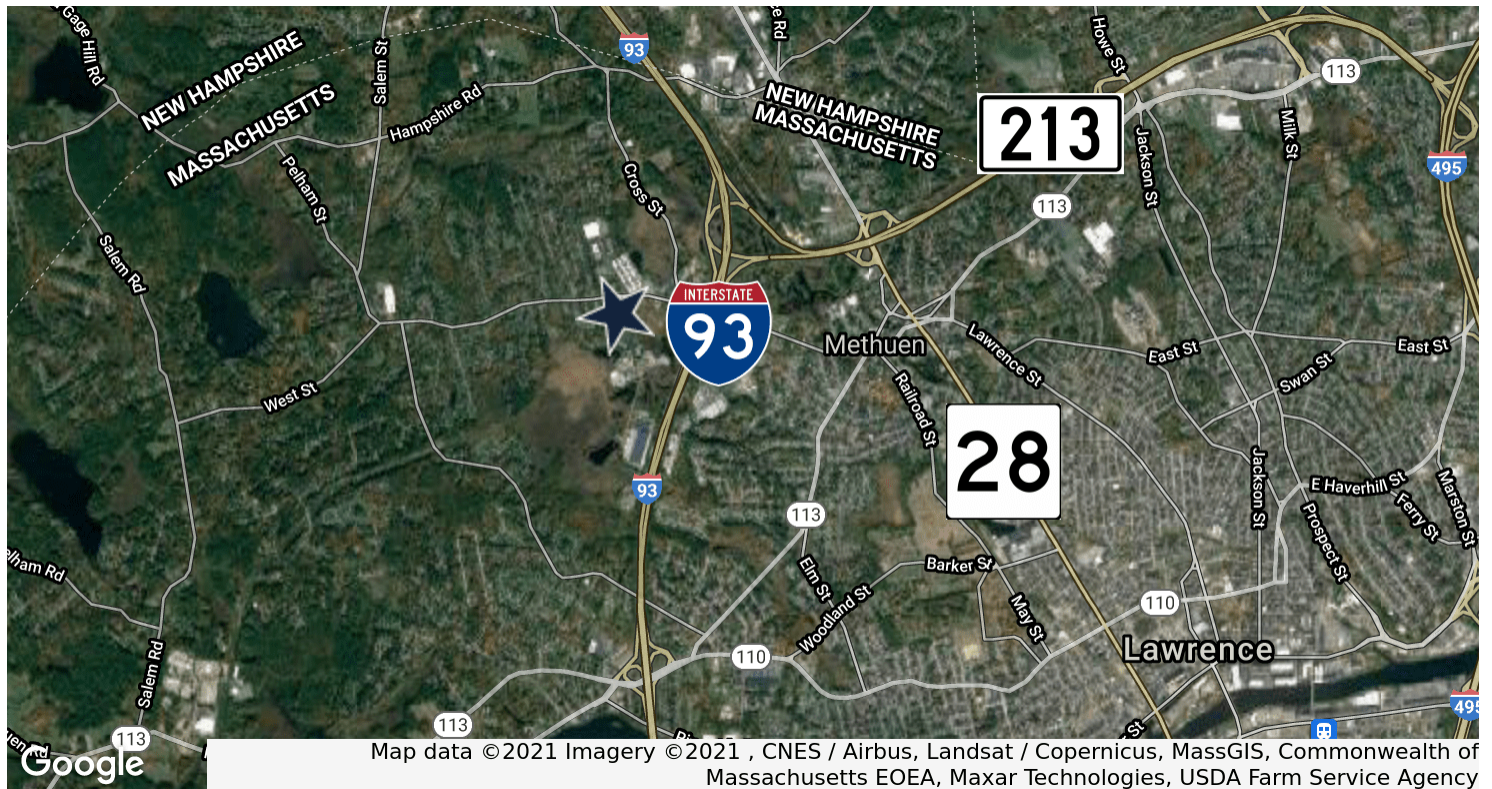
Map data ©2021 Imagery ©2021, CNES / Airbus, Landsat / Copernicus, MassGIS, Commonwealth of Massachusetts EOE, Maxar Technologies, USDA Farm Service Agency